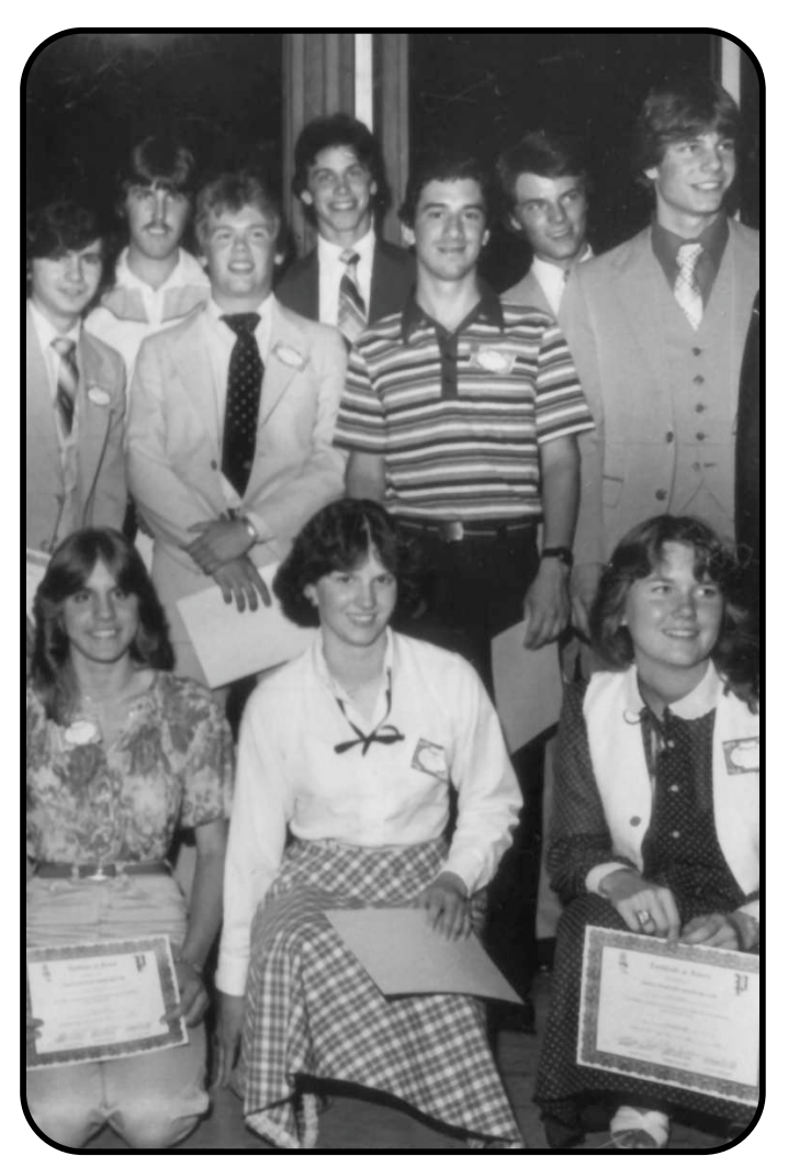
WSDP Staff of 1980

Former staff members can sign up for a show by calling Bill Keith at 734-416-7732 or e-mailing keithb@pccs.k12.mi.us.